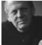
Sir Thomas Allen DIRECTOR

"Thomas Allen [is] a Music Master of supreme vocal and dramatic authority."